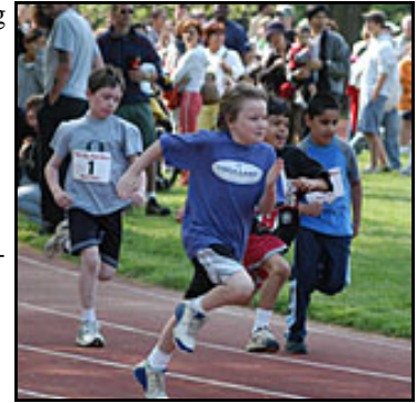
Competitors round the track in last year's Big Red Race.

Beginning at 10:15 a.m., adults will race a flat, twisting, 5-kilometer course around the school campus. There is a $15 non-refundable entry fee for adults ($20 on Race Day); $12 for high school students ($15 on Race Day). For more details, contact BigRedRace@Lawrenceville.org or visit bigredrace.com .