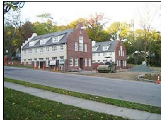
The new architectural additions to Gordon Avenue have a distinctive Dutch influence.