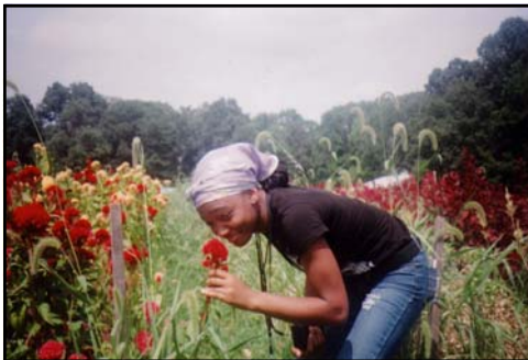
An Ennis Beley Project participant takes time to smell the flowers on a field trip to Cherry Grove Organic Farm.