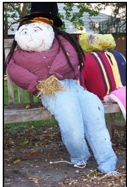
Two of Lawrenceville's many delightful scarecrows relax on a bench in Weeden Park. Township residents of all ages gathered on Oct. 8 for the annual scarecrow-making event sponsored by LMS.